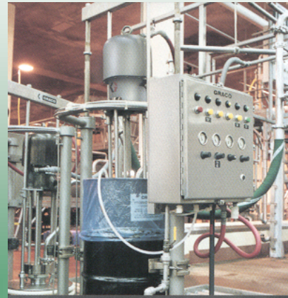
DRUM UNLOADER WITH CONTROLS