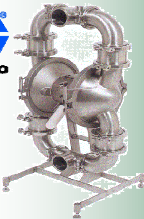
QUICK KNOCKDOWN HUSKY PUMP